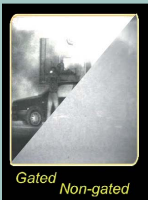
Vision through smoke for security application

Please complete and return the attached registration form duly filled (mail, e-mail, fax). Registration deadline is 14.11.2009.